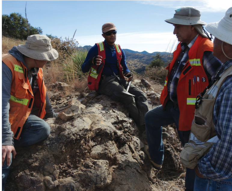
Above right: Azure's Mexican geologists inspecting outcrop on the Mesa de Plata silver deposit

Immediately east of this large silver deposit, Azure has discovered a 300m long high-grade gold zone