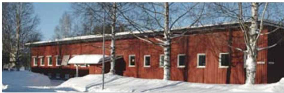
The Mineral Resources Information Office (MINKO) is a regional office within the Geological Survey of Sweden that is located in Malå, northern Sweden. Its commission is to store and supply exploration-related information from Sweden.

In addition to their ongoing research activities at Malå, Saxon and Hudson also travelled the country extensively looking at other metal