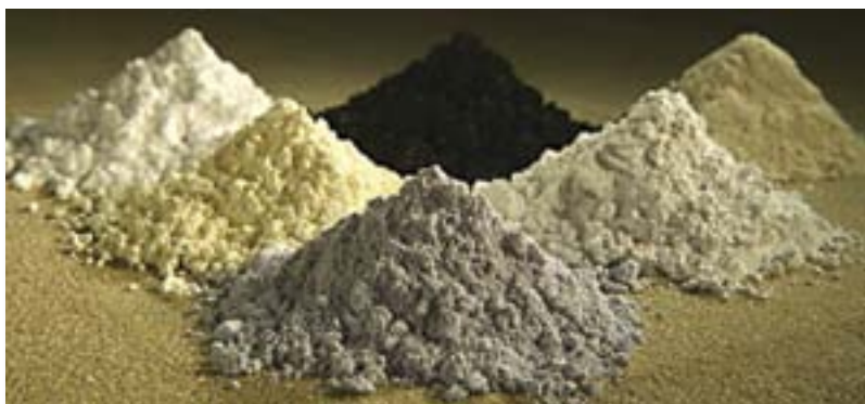
Powders of six rare earth elements oxides. Clockwise from top center: praseodymium, cerium, lanthanum, neodymium, samarium, and gadolinium.

The 16 rare earth elements, plus zirconium, yttrium and niobium, are highly sought after due to their unique chemical properties that make them essential in electronic, optical, magnetic and catalytic applications. They are used in computers, electronics, fibre optic cables, vital military applications and even humble farm machinery. Other applications include: catalytic converters, household appliances, industrial motors, MRI machines, cell phones