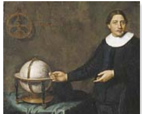
Painting of Abel Tasman attributed to Jacob Gerritsz Cuyp, 1637