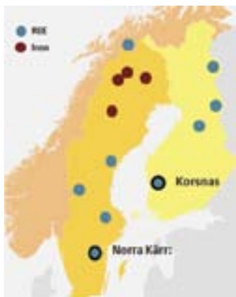
Tasman REE & Iron Projects in the Baltic Shield Region

ies and new mines throughout Sweden, including many around historic mining sites.