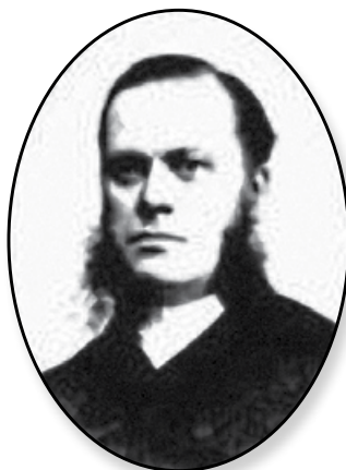
Per Teodor Cleve