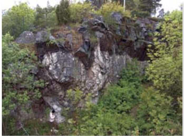
The Famous Feldspar Quarry at Ytterby, Sweden