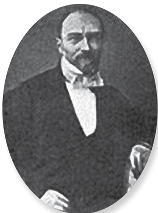
Carl Gustaf Mosander

— From U.S. Geological Survey, Fact Sheet 087-02