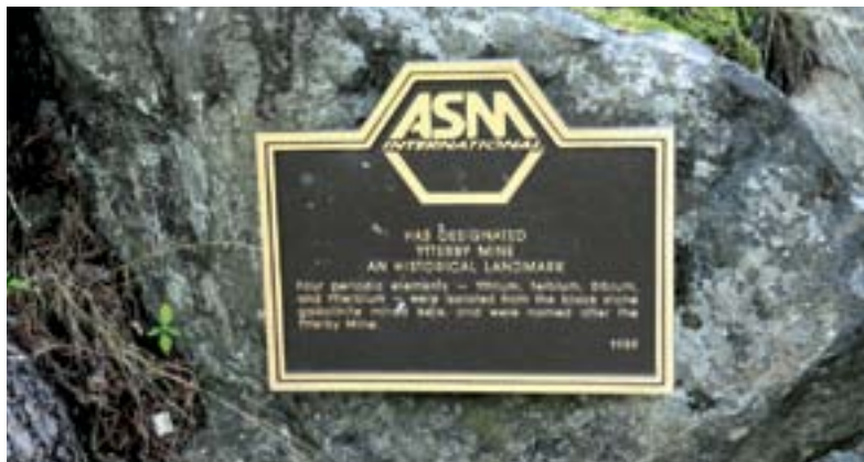
Historical Plaque at the entrance of Ytterby mine.

The material discovered by Arrhenius and Gadolin is one of the family of 16 rare earth elements (“REE”) that are being used to produce energy efficient vehicles and are a key component of wind turbines and other “green technologies”. Their unique chemical and physical properties make them irreplaceable in computer hard drives and catalytic converters, mobile phones, medical devices, lasers, high-powered magnets and numerous other technologies. New uses for these elements are being found all the time and global demand is rapidly expanding—at the same time as supplies are being squeezed.