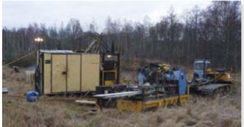
Tasman Crew Setting Up Drill Rig at Norra Kärr (Drilling commenced one month after company went public)